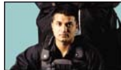
The BLEEX project

Unlike a prosthesis, an orthosis doesn't replace missing limbs. Instead, it attaches to a paralyzed limb and may eventually enhance healthy ones. The 3-pound AAFO covers the leg from below the knee to the toes and restores natural motion.