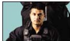
The BLEEX project

Unlike a prosthesis, an orthosis doesn't replace missing limbs. Instead, it attaches to a paralyzed limb and may eventually enhance healthy ones. The 3-pound AAFO covers the leg from below the knee to the toes and restores natural motion.