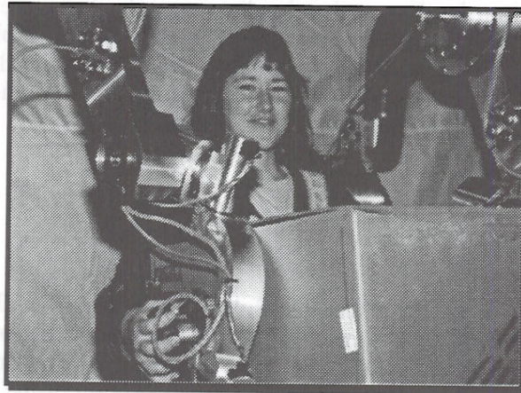
Figure 1: A multi-degree-of-freedom extender for warehouse operation